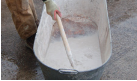
Fig. 5 Slaking quicklime to produce lime putty.