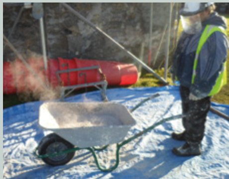
Fig. 8 Hot-mixed lime mortar ready for use on site.