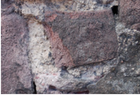
Fig. 10 A lime mortar showing particles of un-slaked lime, characteristic of a hot-mixed lime mortar.

Frost resistance: Hot-mixed lime mortars, whether pure or gauged, seem to have good frost resistance. The reasons for this are not generally well understood, but it may be partly due to the way these mortars are produced: the slaking lime/sand mix produces steam, resulting in an open-pored structure. This seems to have a beneficial effect on the hardened mortar, improving its overall capacity to disperse liquid water and cope with the expansion of freezing water.