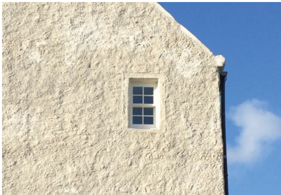
Fig. 12 Modern gauged hot-mixed lime harling on a building in Shetland.