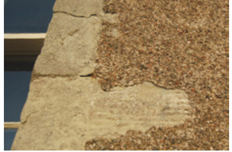
Fig. 11 Weathered lime harling on an early 19th century building in Shetland.

Economy: Quicklime is generally a cheaper product than lime putty, NHLs or other proprietary lime products. Quicklime can more than double in volume during its reaction with water and so less is required for a proportionate mix. Manufacturers and suppliers should be able to provide a figure for the bulk density of their quicklime to enable accurate batching.