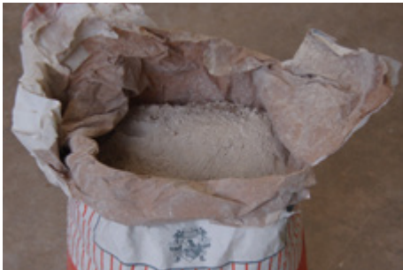
Fig. 7 Natural Hydraulic Lime (NHL).