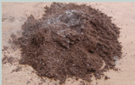
Fig. 9 Quicklime slaking with damp sand.