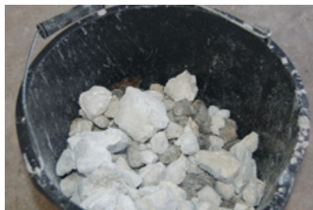
Fig. 2 Lump quicklime.

to form a putty or a dry hydrate powder) is added to aggregate to form a mortar. Hot-mixed lime mortars have some different properties to mortars prepared from mature lime putty or bagged dry hydrate powdered lime due to the effect of the heat of the reaction, and the high alkalinity of the lime, on the aggregates and other components in the mix.