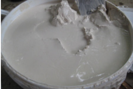
Fig. 6 Mature lime putty.