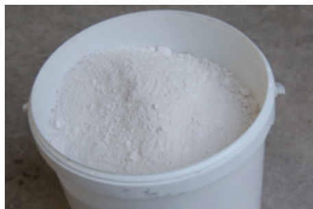
Fig. 4 Powdered quicklime.