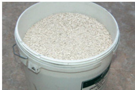
Fig. 3 Granulated quicklime.